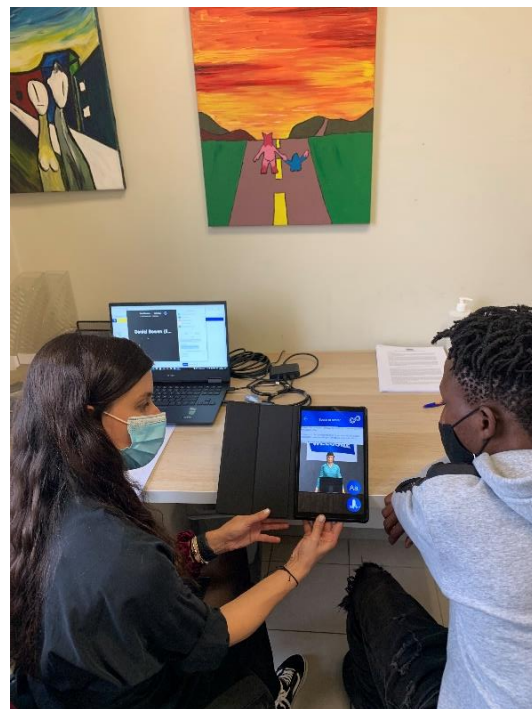
First Prototype Trial in PRAKSIS premises, Greece

Each TCN was informed about the project and the possibilities of the current functionalities and they personalized the Avatar. They tried the dialogue with the Agent and the VR App and then evaluated the prototype using specific questionnaires.