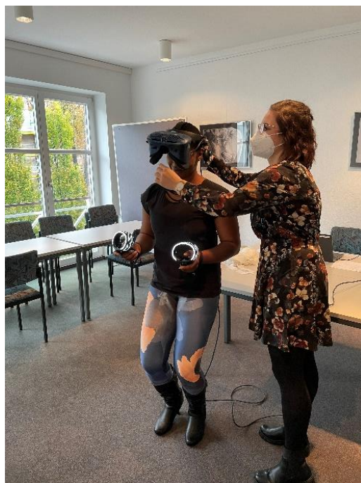
VR Trial in Hamm, Germany

The MyWELCOME App also has a FAQ Service, which is customized to account for the needs which a region or country may have. It contains answers on several topics or direct links to where the TCNs can find the complete information regarding their question. It is thus a quick and easy way for TCNs to find information. Furthermore, there is the possibility of the Agent reading aloud the written text, making it more accessible to those who are illiterate or have visual impediments, for instance.